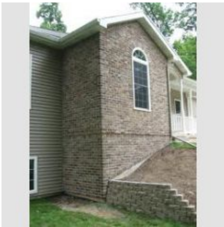
Thin Brick used as an accent on exterior siding.

Innovative Home Concepts, Inc. in conjunction with Robinson Brick is proud to introduce a new remodeling product to the Chicago Market.