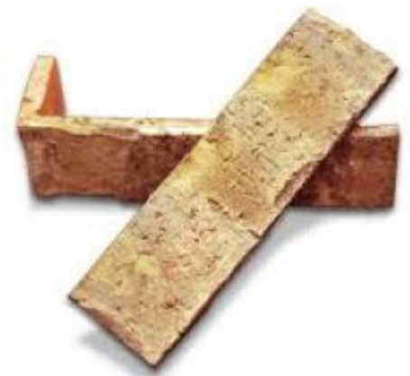
Thin brick pieces. Alternative to brick and siding.

Houses with brick exteriors have a warm style and rich look to them. But unless a home was originally built to support a real brick exterior, homeowners had very little choice if they wanted to add this dimension to their homes. Most had no choice but to use conventional vinyl siding or wood siding, until now.